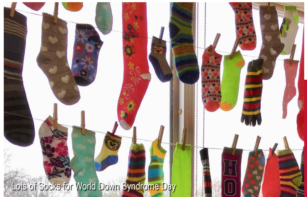
Lots of Socks for World Down Syndrome Day