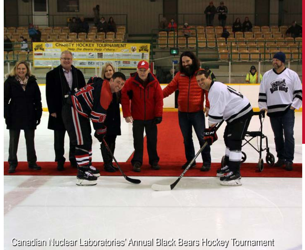
Canadian Nuclear Laboratories' Annual Black Bears Hockey Tournament

We are proud to be a corporate sponsor of the Stratford Soccer Association , supporting the many improvements of the very vibrant Festival Hydro Community Park. NA Engineering Associates Inc. extends our best wishes to all players within the SSA for a fun and safe upcoming season!